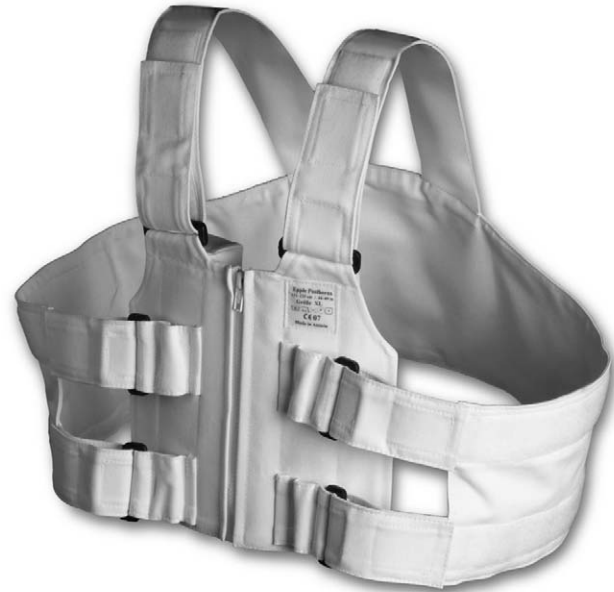
Fig. 1. The Posthorax ® sternum vest provides stabilisation with its two pads in the front and lateral flaps.

The Posthorax ® sternum vest (Epple Inc., Vienna, Austria) provides anteroposterior stabilisation of the thorax. Two pads placed on each side of the sternum, ergonomically fitted for males and females, prevent intrinsic movement of the two sternum halves (Fig. 1). Lateral flaps are designed for optimum fit, allow for normal breathing and stop over-extension. The individual sizing and upper straps stop the thorax support vest sliding to the abdominal region.